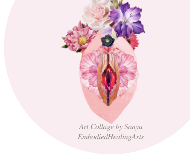
Art Collage by Sanya EmbodiedHealingArts

One of the issues many women face is that they simply are not being educated about the power and importance of their pelvis in sustainable ways that actually connect them to the body and its wisdom.