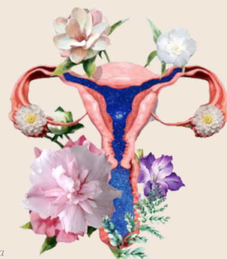
Art Collage by Sanya EmbodiedHealingArts