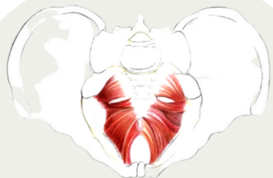
The deep layer of the pelvic floor from above

The insight shared in our accompanying video shows you a foundational practice for the pelvic floor, along with additional tools to open your heart area and voice in connection to the pelvis.